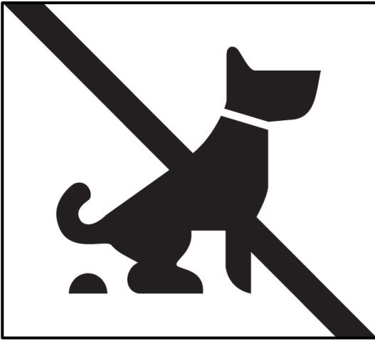
Schedule 1. Remove faeces