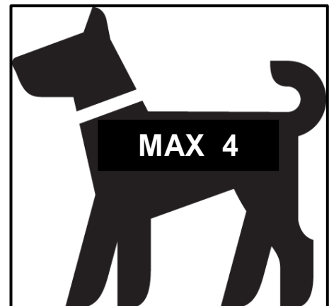
Schedule 5. Max number of dogs