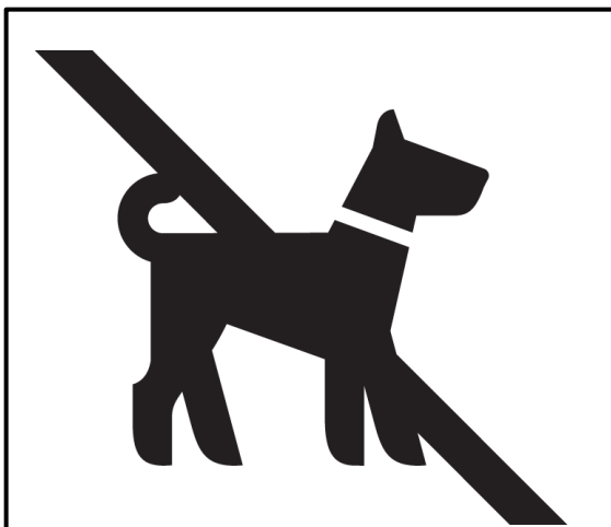
Schedule 4. Dog exclusion area