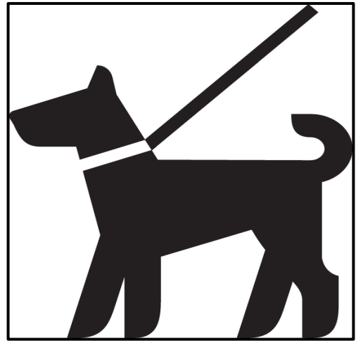
Schedule 2. Dogs on leads at all times